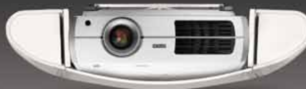
Epson PowerLite® Home Cinema 8100/8500 UB series projector with integrated surround sound speaker cradle (also available with a Home Cinema 720 projector)