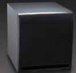
10-inch subwoofer with 5.1 channels of amplification