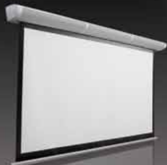
100-inch electric screen with integrated LCR speakers