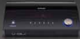
AV controller with built-in DVD and 1080p HDMI output